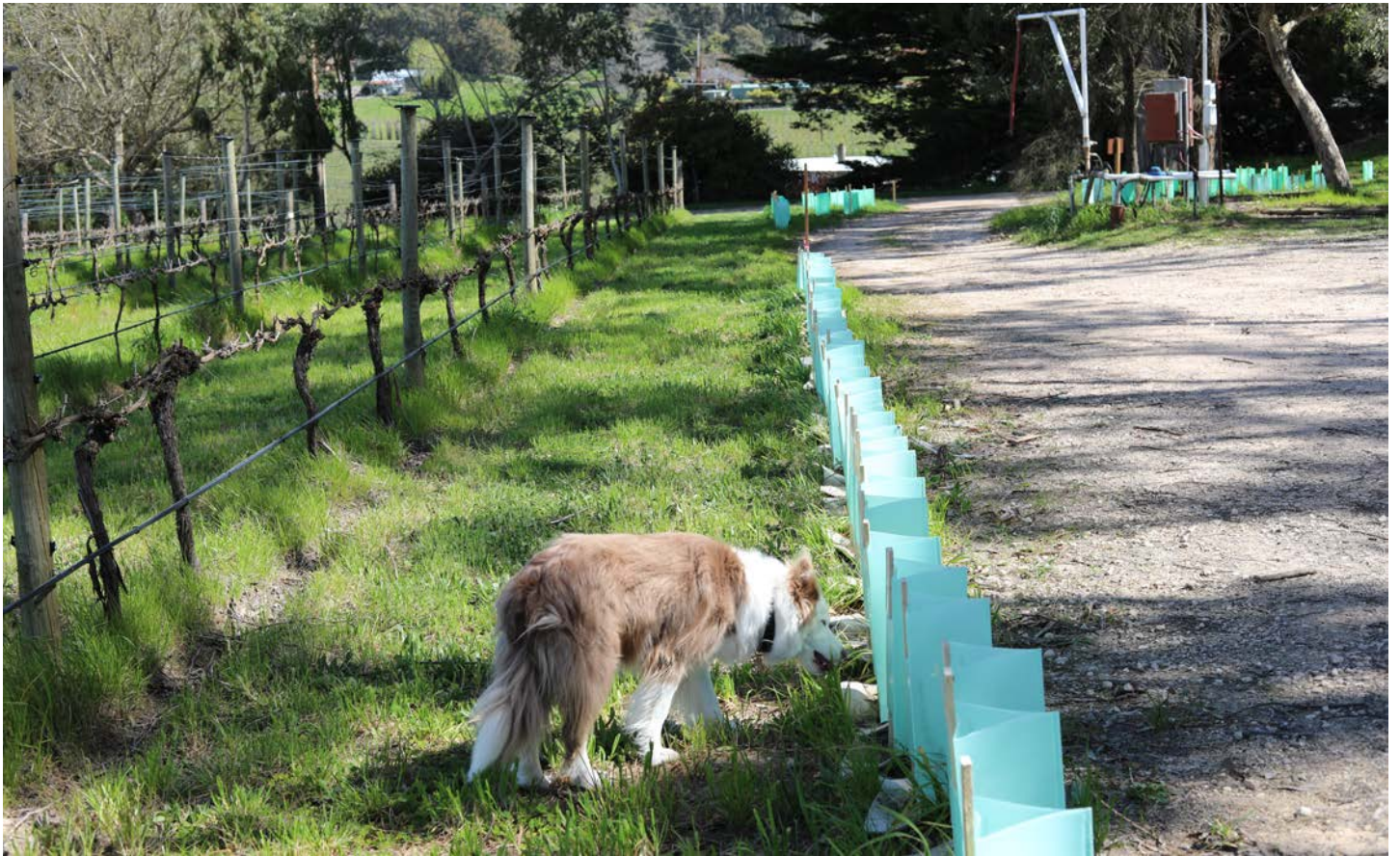
7 September 2020