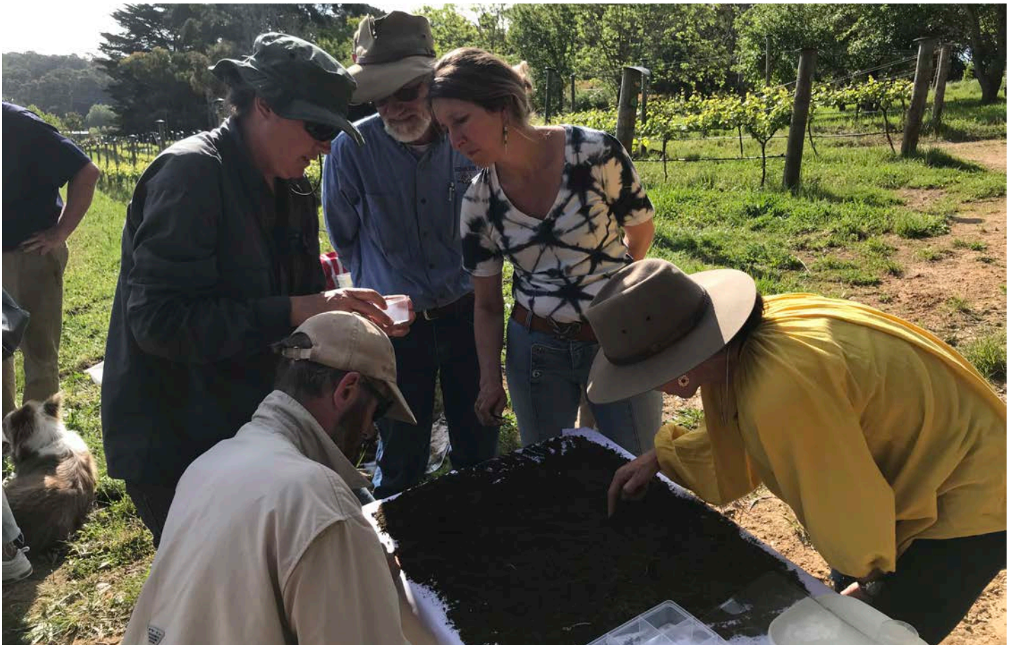
EcoVineyards field session focusing on soil health