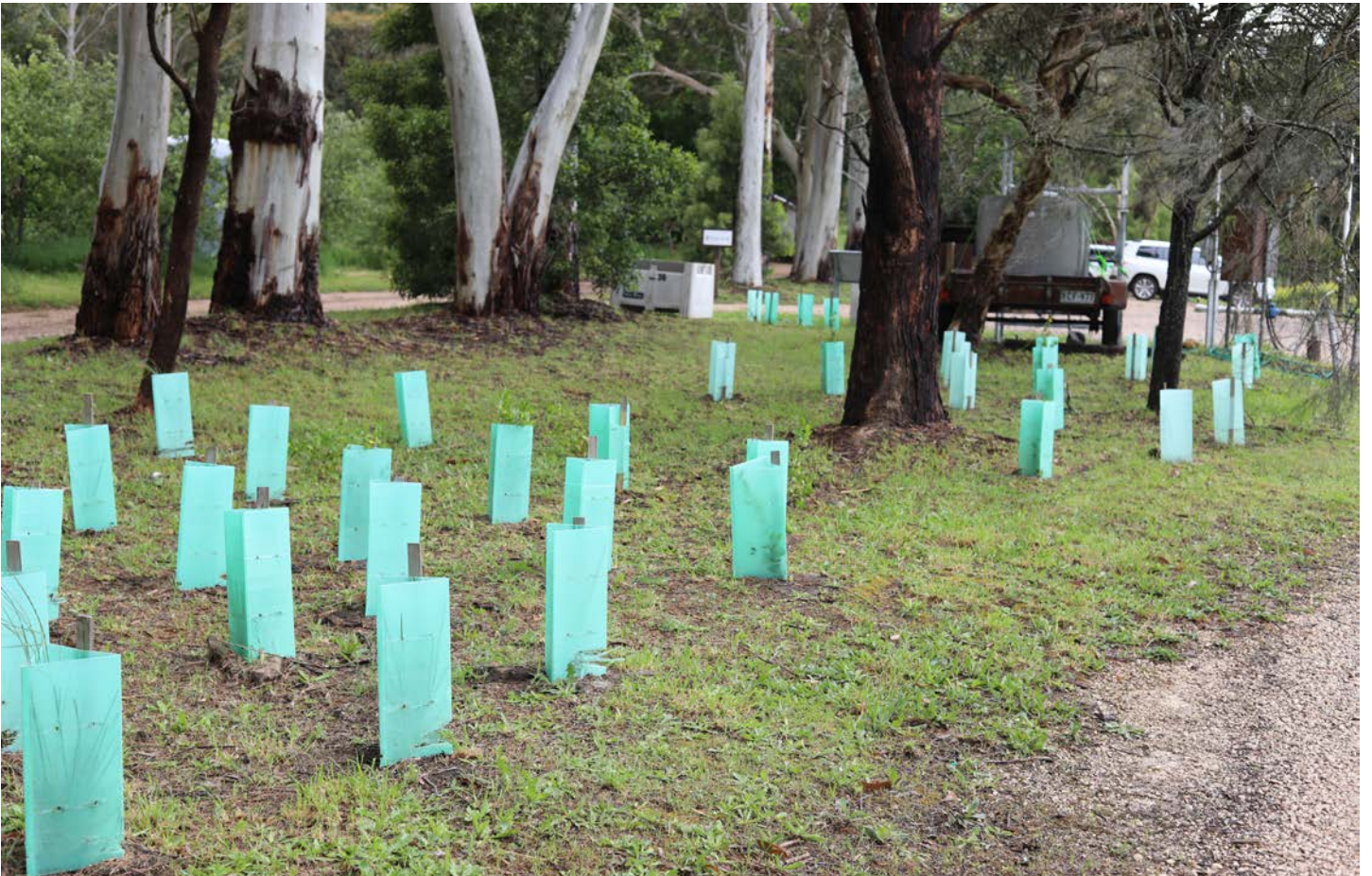
12 November 2021