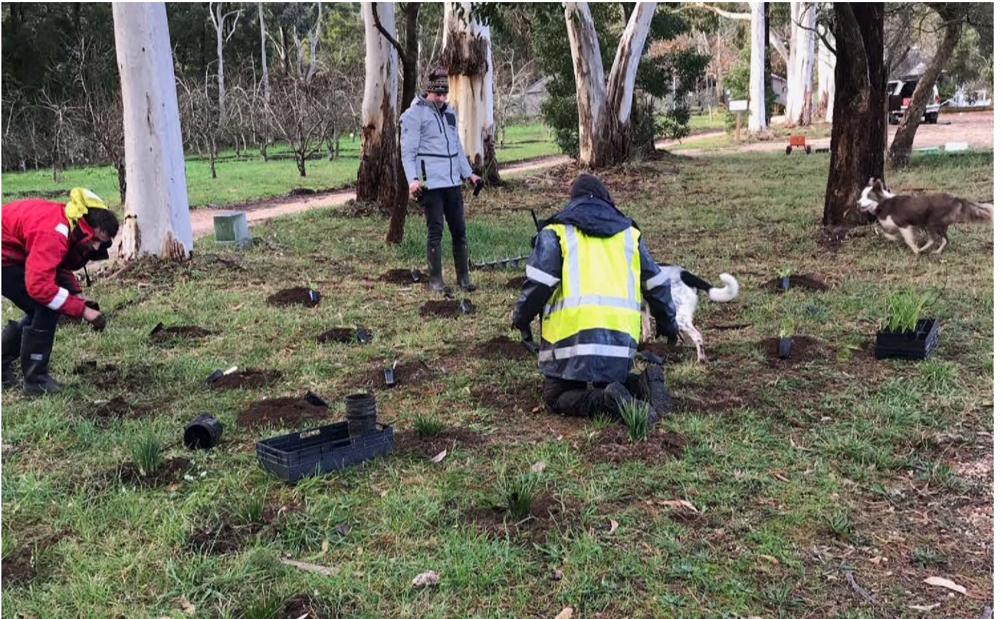
3 July 2020