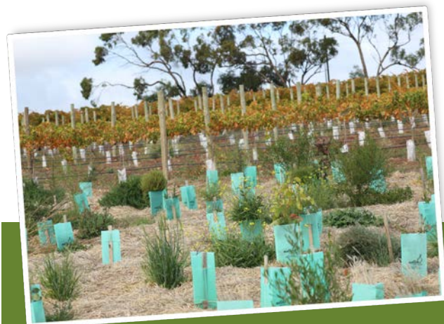
Photo above: Chrysocephalum apiculatum , common everlasting.