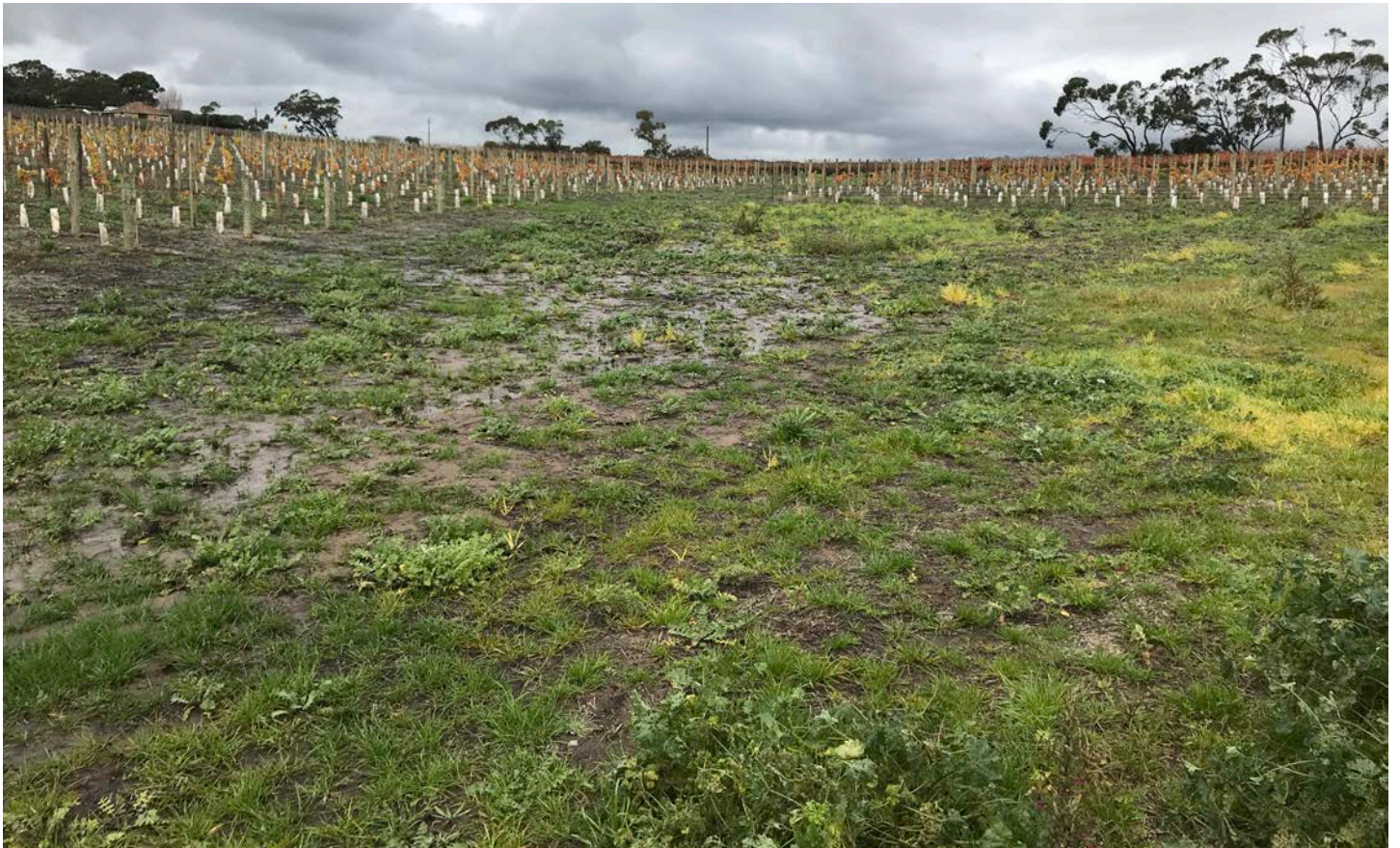
Before: 24 June 2020