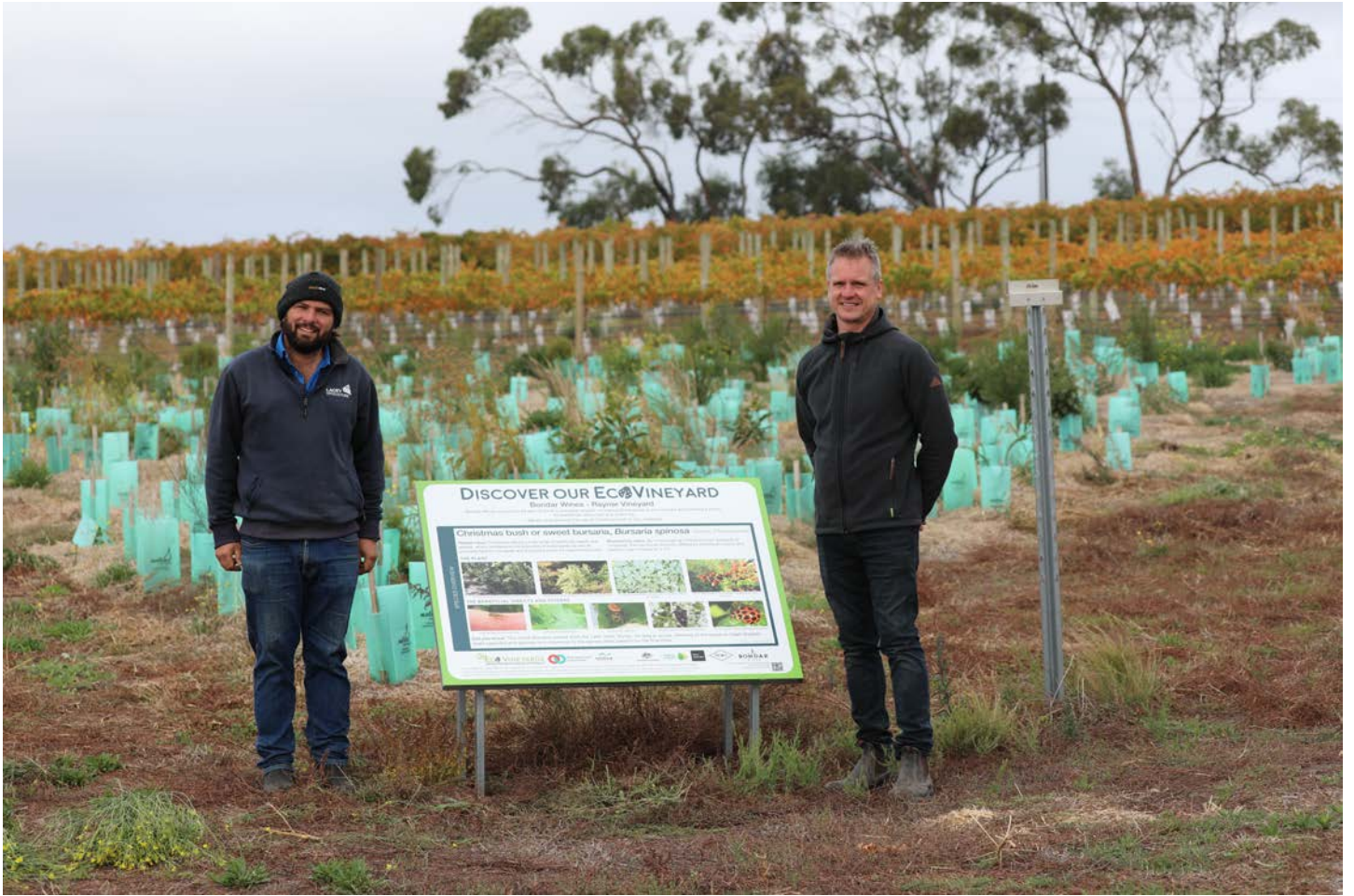
After: 10 May 2021

This project is supported by the Department of Agriculture, Water and the Environment through funding from Australian Government's National Landcare Program