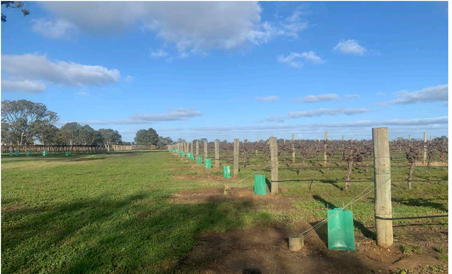
Year 1: 16 September 2020 the rose bushes were removed, and native insectary shrubs planted