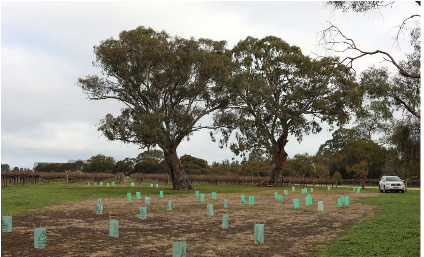
Year 1: 20 July 2020