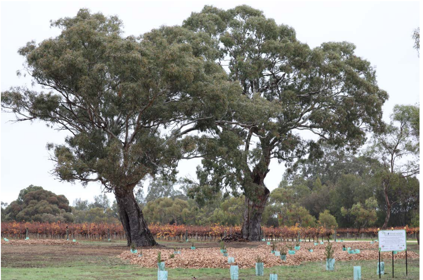
Year 2: 20 May 2021