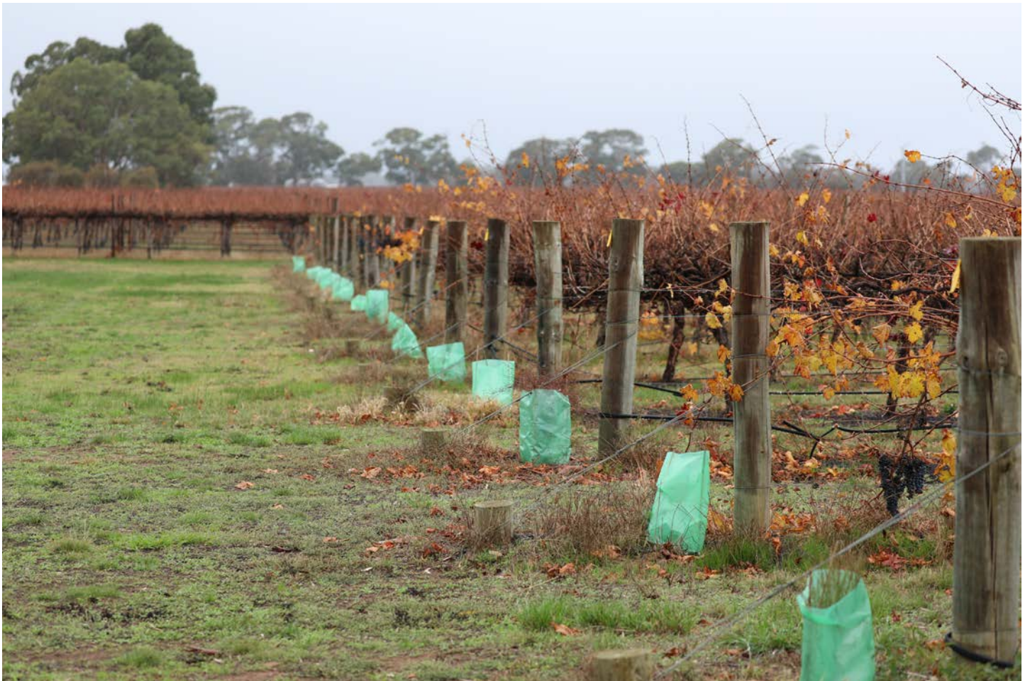
Year 2: 20 May 2021