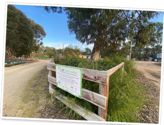
Photo above: The initial trial planting under the gum tree – the growth is very good as this area is watered regularly

We also spent a considerable amount of time cleaning up the woodland area in preparation for planting in winter 2021. The plants were guard with white 'milk carton' style guards both at the end of the rows and around the cellar door and the driveway.