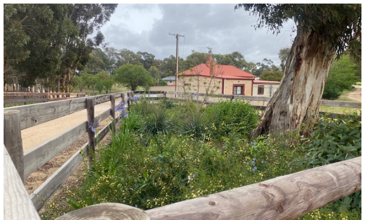
After: The establishment of the native plant observation area to assess the habit and success of individual native plants prior to scaling up the plantings on the property established in May 2020 and then in November 2021