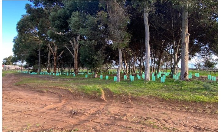
Before: Cleaning out the woodland area ready for planting in August 2021 and the end results, lots of native insectary understorey plants protected from rabbits using coreflute guards in November 2021