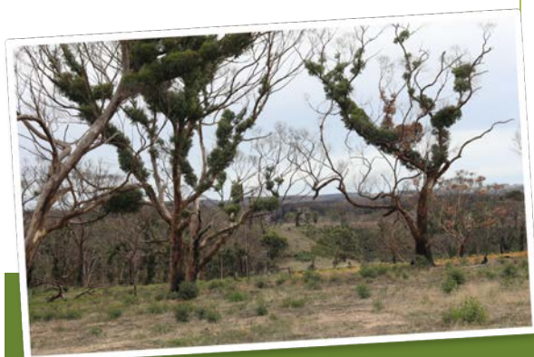
Photo left: Native eucalypts are regenerating after the fires in January 2020 (Photo: Mary Retallack).

Photo above: Yale installing the photo point (Photo: Mary Retallack).