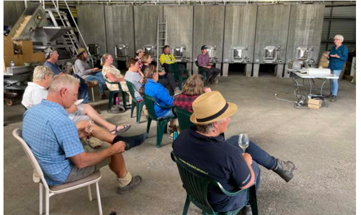
December 2021: Field talks focussing on predatory arthropods and raptor birds