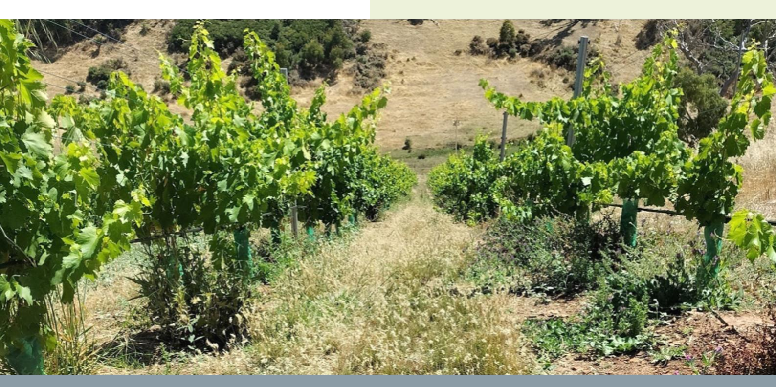
Photo above: View from the top 29th of June 2022 Photo left: Looking good on the 31st of January 2023 (Photos: Greg Horner).