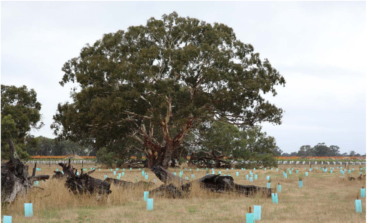
Native insectary planting: 20 May 2021