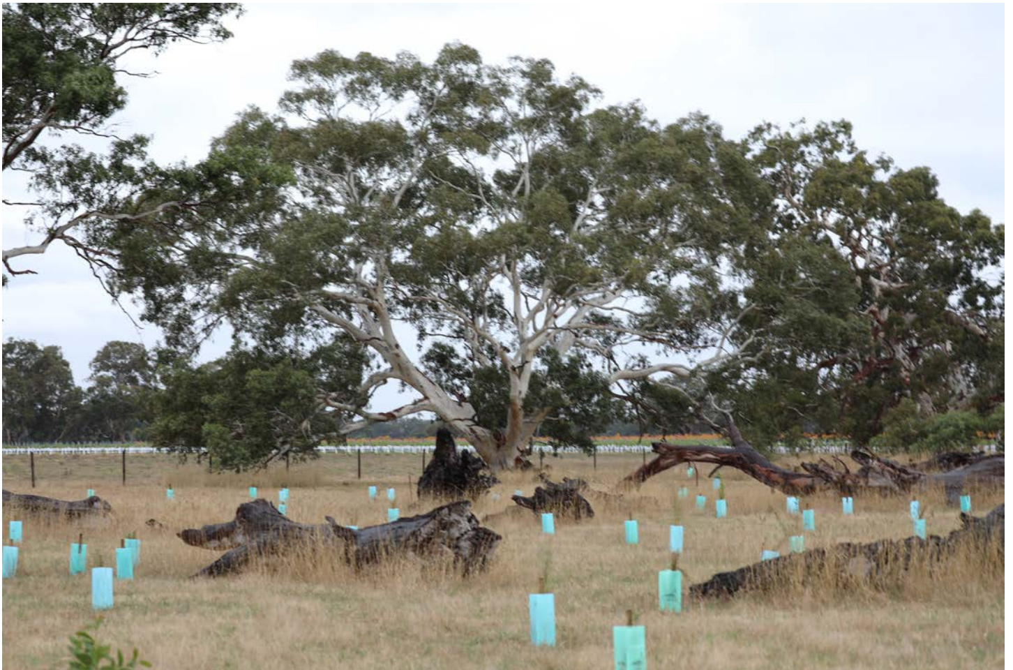
Native insectary planting: 20 May 2021

This project is supported by the Department of Agriculture, Water and the Environment through funding from Australian Government's National Landcare Program