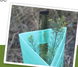
Pictures of the native insectary plantings at the new vineyard site (Photos: Mary Retallack).