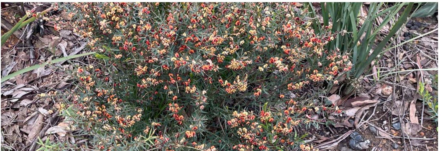
Regenerating roadside vegetation