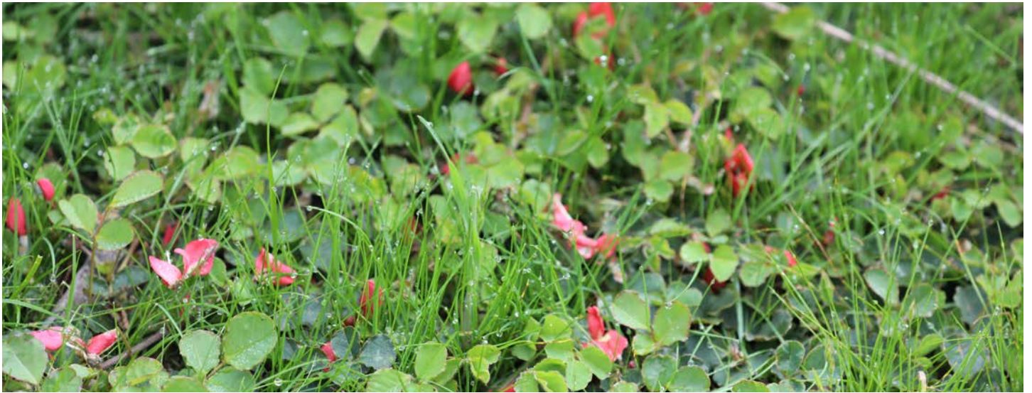
Running postman, Kennedia prostrata in flower - September 2021