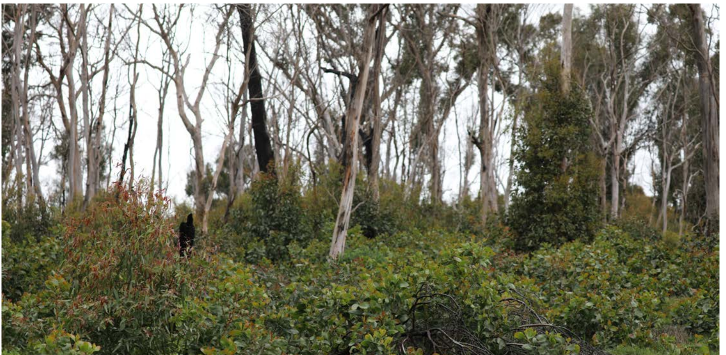
Epicormic growth originating from fire damaged gum trees