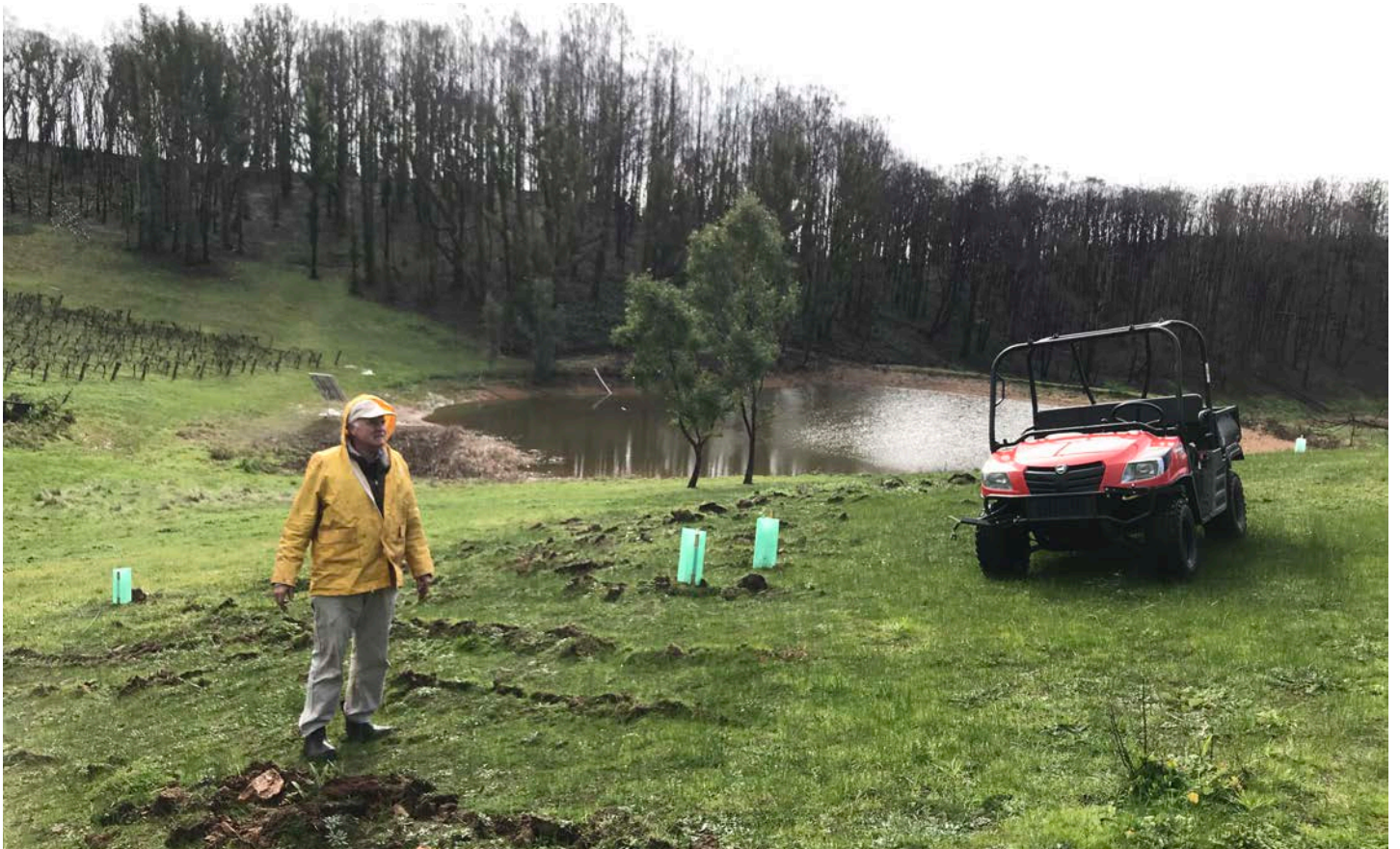
Before: 22 June 2020