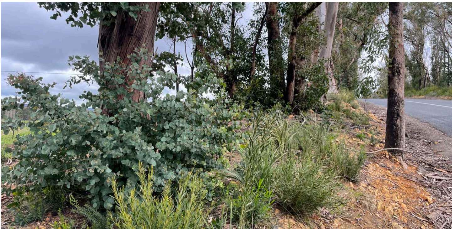
Regenerating roadside vegetation