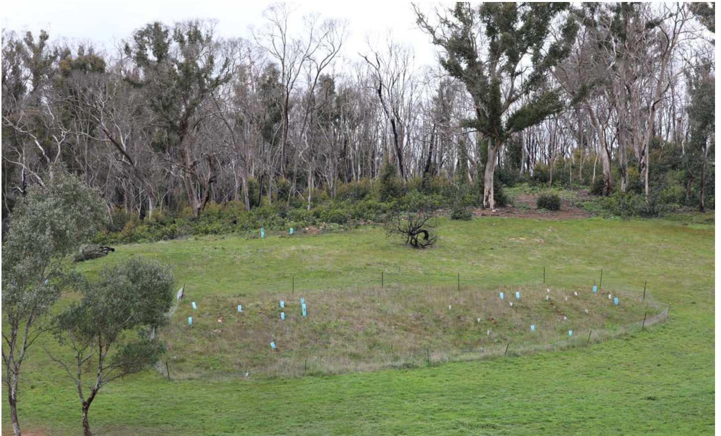
After: 6 September 2021