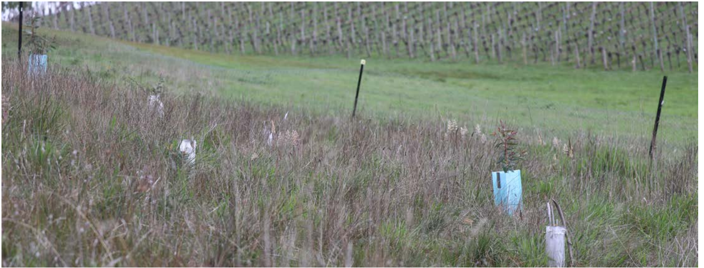
Native insectary plants in establishment adjacent to the vineyard