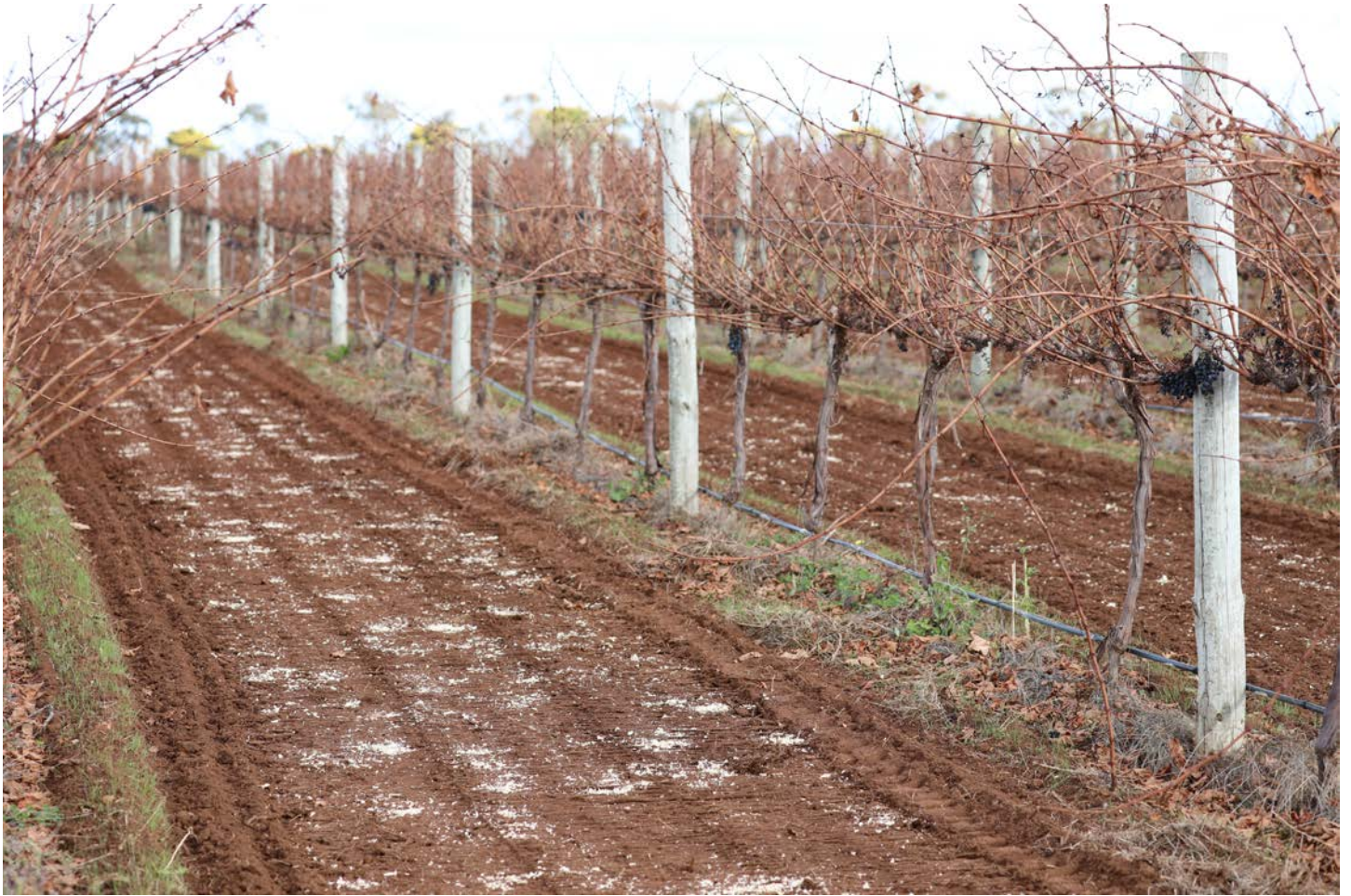
Sowing of native grasses and forbs: 20 May 2021