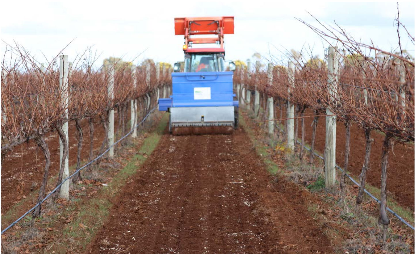
Sowing of native grasses and forbs: 20 May 2021