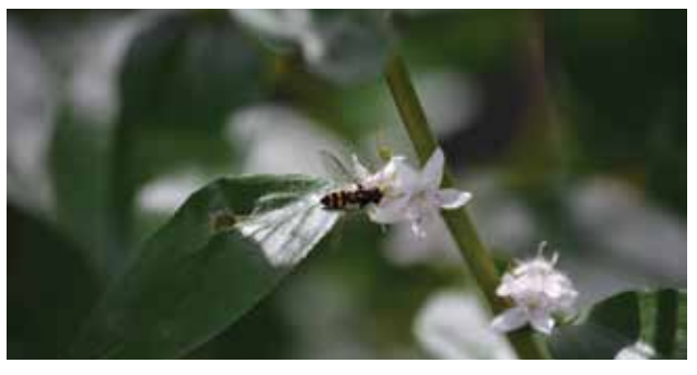
Figure 41 Local native plants like sticky boobialla, Myoporum petiolatum (syn. viscosum), attract hoverflies, as seen here near a McLaren Vale vineyard – often seen hovering in midair, darting a short distance, and then hovering again, these beneficial insects are valuable tools in the fight against aphids, thrips, scale insects and caterpillars.

Habitat : adults are attracted to nectar and pollen producing plants, including Christmas bush, B. spinosa , prickly tea-tree, L. continentale , and grapevines. They are also found in association with wallaby grasses, Rytidosperma species, during spring and summer (Retallack 2019).