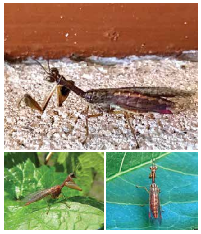
Figure 57 A mantid lacewing (top). Figure 58 Mantid lacewings on grapevine (bottom).

Sensitivity to sprays : pesticides are toxic to lacewings; and some fungicides may be disruptive. Chlorpyrifos can persist in toxicity for up to eight weeks; and along