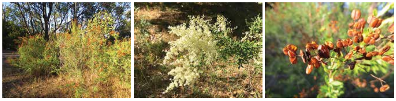
Figure 1 Christmas bush, Bursaria spinosa, exhibits a natural sprawling habit (left), small creamy coloured flowers that provide pollen and nectar (centre), and distinctive seed pods (right). Images: Mary J Retallack

The opportunity to plant selected native insectary species could help winegrape growers save time and resources by producing fruit with lower pest incidence, while enhancing the biodiversity of their vineyards and properties.