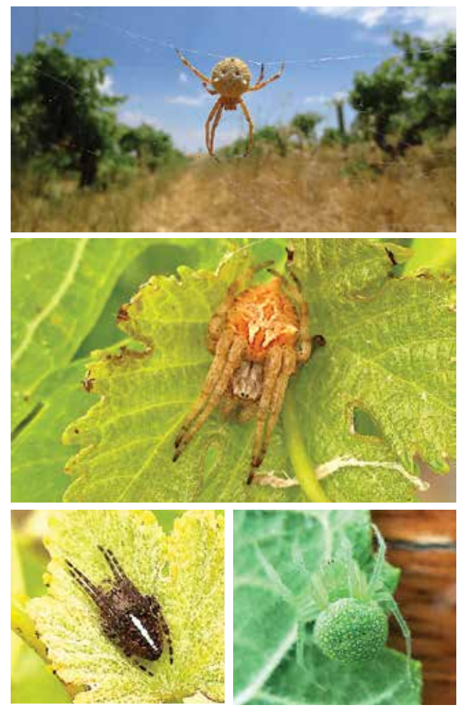
Figure 68 Garden orb-weaver, Eriophora species – hanging between grapevine rows (top), and on grapevine (middle).

contribute to the control of flying pest insects, as well as a range of other arthropod pests, including scale insects (Thomson et al. 2007).