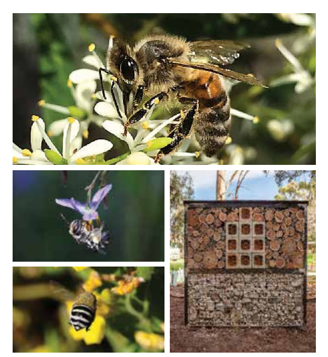
Figure 80 Honey bee on Christmas bush (top); native nomia bee, Lipotriches (Austronomia), foraging a native lily (middle left).

Buzz pollination : some native bees use a special pollination technique called 'buzz pollination'. The 'blue-banded bee', for example, bangs its head on the flower's anthers 350 times a second to release the pollen (Switzer et al. 2016)!