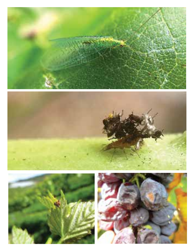
Figure 53 Adult green lacewing, Mallada signata, on grapevine (top); a 'junk bug' – a green lacewing larva with remnants of dead prey attached to small spines on its back (middle).

Significance to viticulture : green lacewings can be purchased from commercial suppliers for release as biocontrol agents of light brown apple moth (LBAM), soft scale and mealybugs (Bernard et al. 2006b). They will be more likely to establish if there is a refuge of suitable nectar-producing trees and/or shrubs nearby.