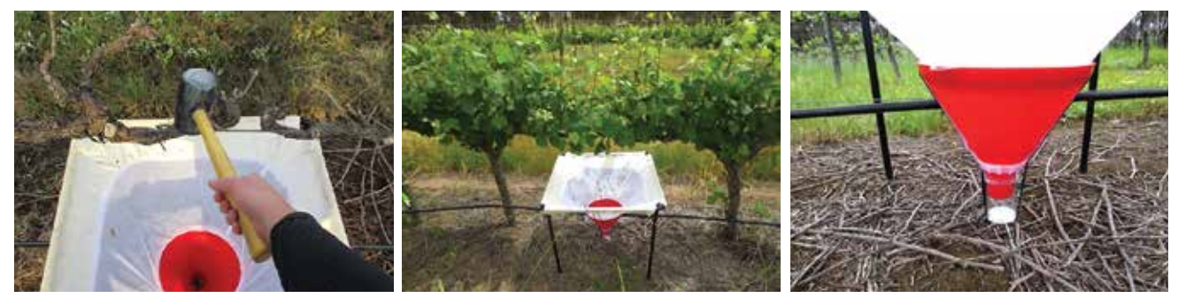
Figure 4 A rubber mallet is used to strike the cordon to dislodge the arthropods (left), the net is placed below the cordon (centre), and insects are collected in a plastic container positioned below the funnel (right).

Arthropod samples can be collected from grapevines by firmly striking the cordon with a rubber mallet over a beat net fashioned around a card table frame, which holds a funnel and plastic collection container (see Figure 4).