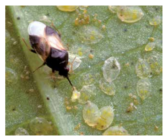
Figure 11 A minute pirate bug.

Development time from egg to adult can vary from 16 to 18 days at 25°C. Females lay an average of two to three eggs per day and live for three to four weeks.