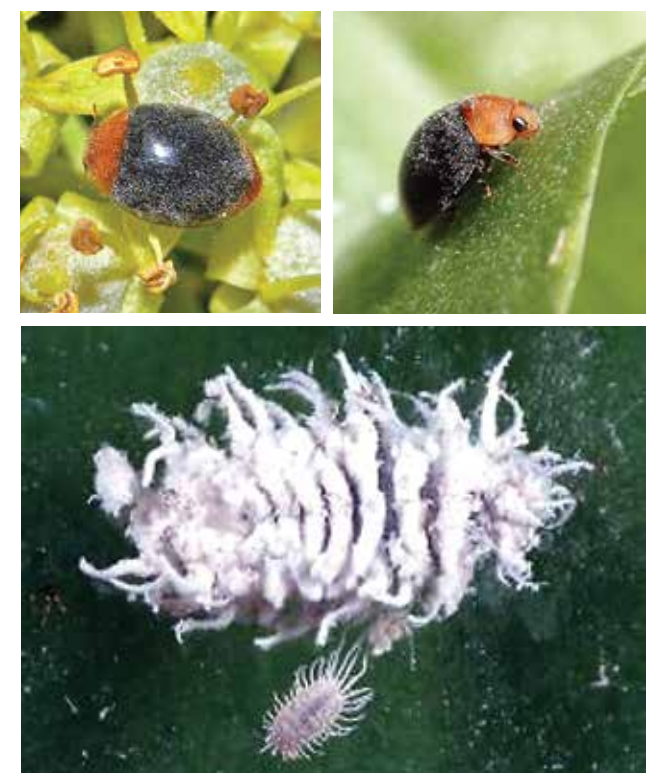
Figure 27 Cryptolaemus montrouzieri, mealybug-destroyer ladybird beetles (top). Images: H Casselmann CC BY-SA 3.0 (left) and CC BY-SA 4.0 (right)]

Significance to viticulture: Cryptolaemus are a very efficient natural enemy of light brown apple moth (LBAM) caterpillars and eggs, mealybugs, and scale insects (Bernard et al. 2007; Thomson et al. 2007).