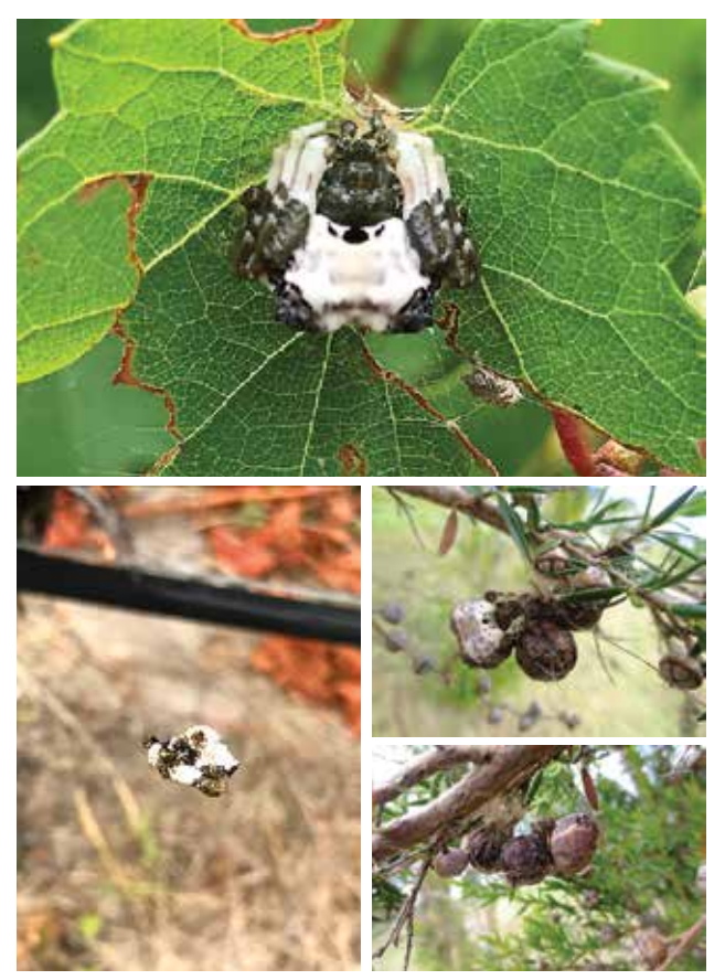
Figure 66 Adult bird-dropping spider on grapevine (top); adult bird-dropping spider hanging from a silken thread waiting for prey in a vineyard (bottom left).

Breeding cycle : females lay up to 13 egg sacs, with about 200 eggs in each, strung together with strong silk threads.