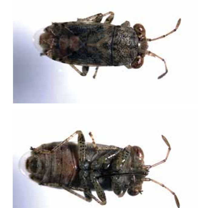
Figure 12 A top view (TOP) and an underside view (ABOVE) of a big-eyed bug, where the proboscis can be seen tucked under the body.

Sensitivity to sprays : predatory bugs are particularly sensitive to carbaryl, methomyl, fipronil, indoxacarb, organophosphates, pyrethroids and spinosad (Thomson 2012). Residues of some chemicals on foliage, or in plant tissues, may remain toxic to predatory bugs for many months (Biological Services 2019).