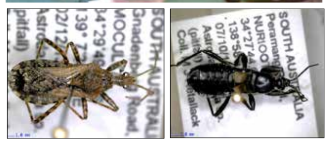
Figure 18 Orange assassin bug, Gminatus australis, on Christmas bush, Bursaria spinosa (top and middle). Images: Mary J Retallack

Figure 19 'Brown assassin bug', Coranus species (bottom left); 'black ground assassin bug', Peirates species (bottom right). Images: Mary J Retallack