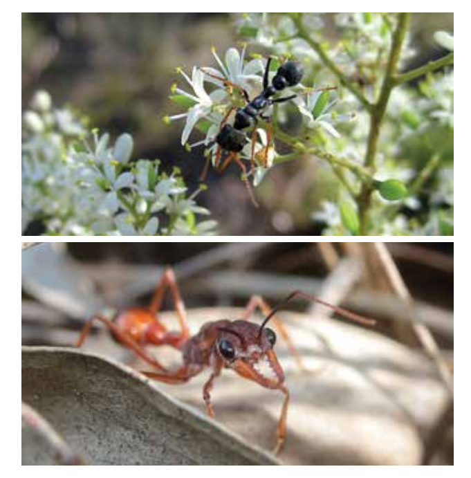
Figure 52 Jack jumper ant, Myrmecia pilosula, on Christmas bush (top); an ant in leaf litter on the ground (bottom).

Significance to viticulture : omnivore ants are generalist feeders of a range of pest species. Meat ants, Iridomyrmex species, are some of the few predators that will consume black Portuguese millipedes (Crawford 2015).