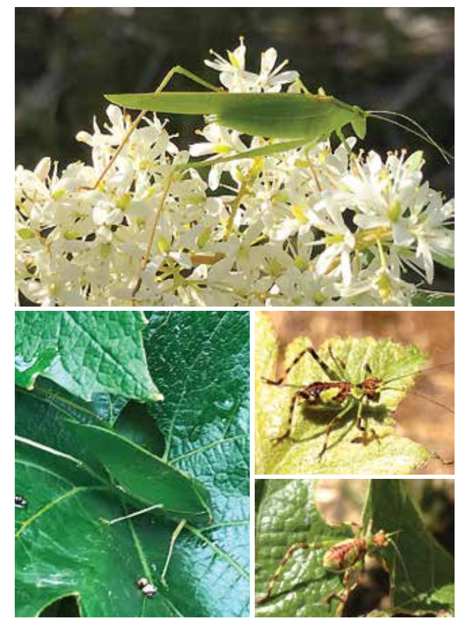
Figure 63 Adult katydid on grapevine (bottom left), and on Christmas bush (top).

Significance to viticulture : some species of katydids are predators of insect pests and their eggs.