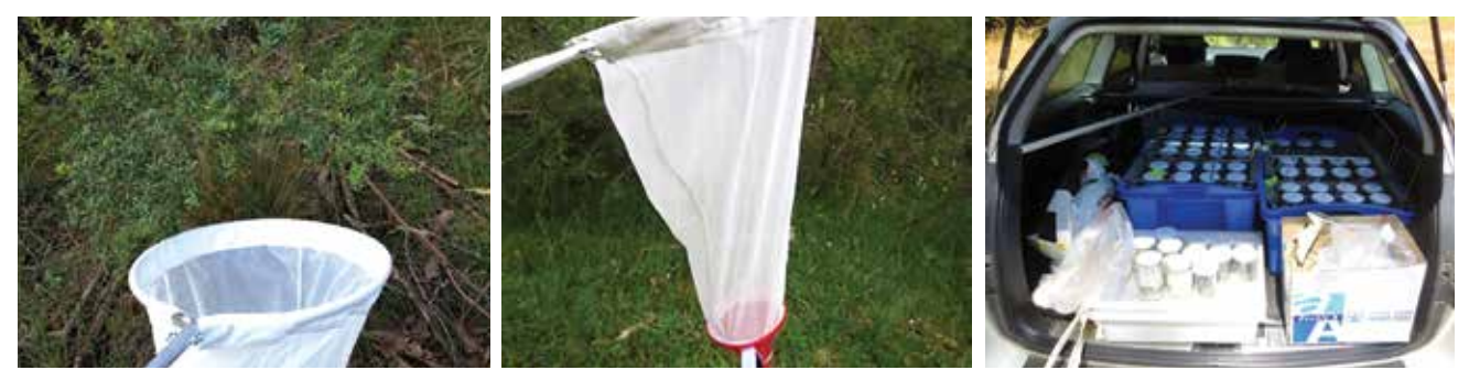
Figure 5 Foliage is placed inside the modified sweep net (left), the captured arthropods fall to the bottom of the net (centre), and can then be immobilised in the field and placed in storage containers (right).

Arthropods found in association with native insectary shrubs can be collected by firmly shaking the foliage inside an insect sweep net, which has been modified to hold a funnel and a collection container. Collected arthropods can then be immobilised in the field if required. (See Figure 5).