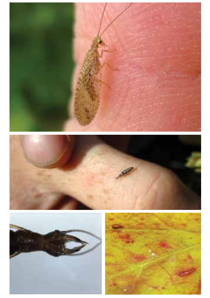
Figure 55 Adult brown lacewing, Micromus tasmaniae (top); brown lacewing larva (middle). Images: Mary J Retallack

Significance to viticulture : brown lacewings are important biocontrol agents of light brown apple moth (LBAM), soft scale and mealybugs (Bernard et al. 2006b). They will be more likely to establish if there is a refuge of suitable nectar producing trees and/or shrubs nearby.