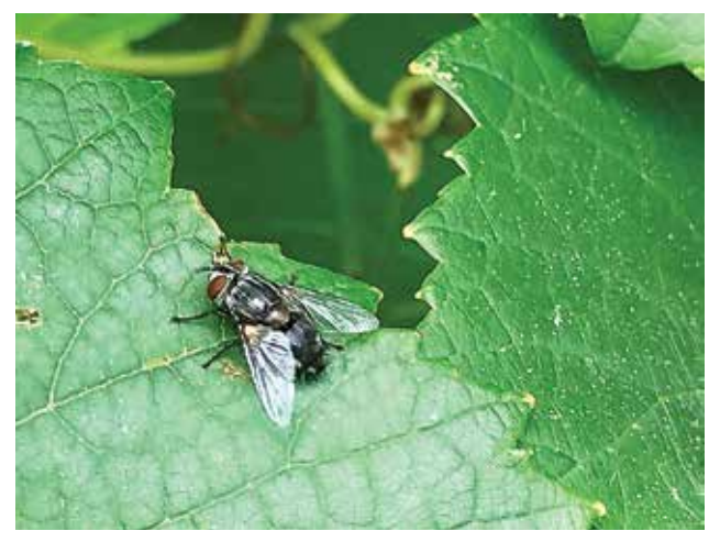
Figure 44 Tachinid fly on grapevine.

Breeding cycle : some tachinid flies lay their eggs directly on their hosts, which then hatch and penetrate their victims. Others lay their eggs on the host's food plants, which are then consumed along with the plant. Once inside, the eggs hatch within their host, and the larvae penetrate the gut wall. The larvae have three moults before they pupate.