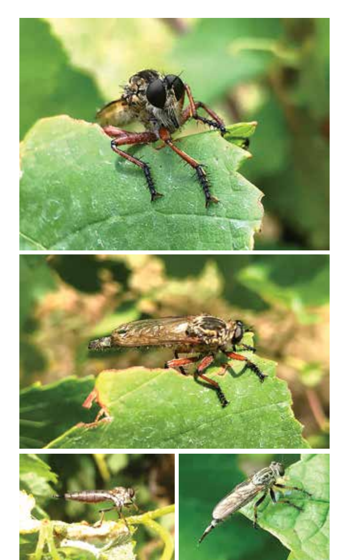
Figure 42 Robber flies on grapevine (Top and Middle). Figure 43 Robber flies on grapevine (Bottom).

Sensitivity to sprays : the high mobility of robber flies in vineyards means that this information is not readily available. Collateral damage will occur if broad-spectrum insecticides are used.