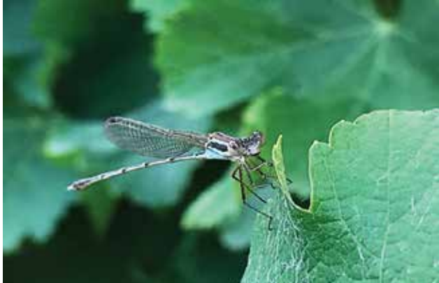
Figure 10 Damselflies on grapevine.