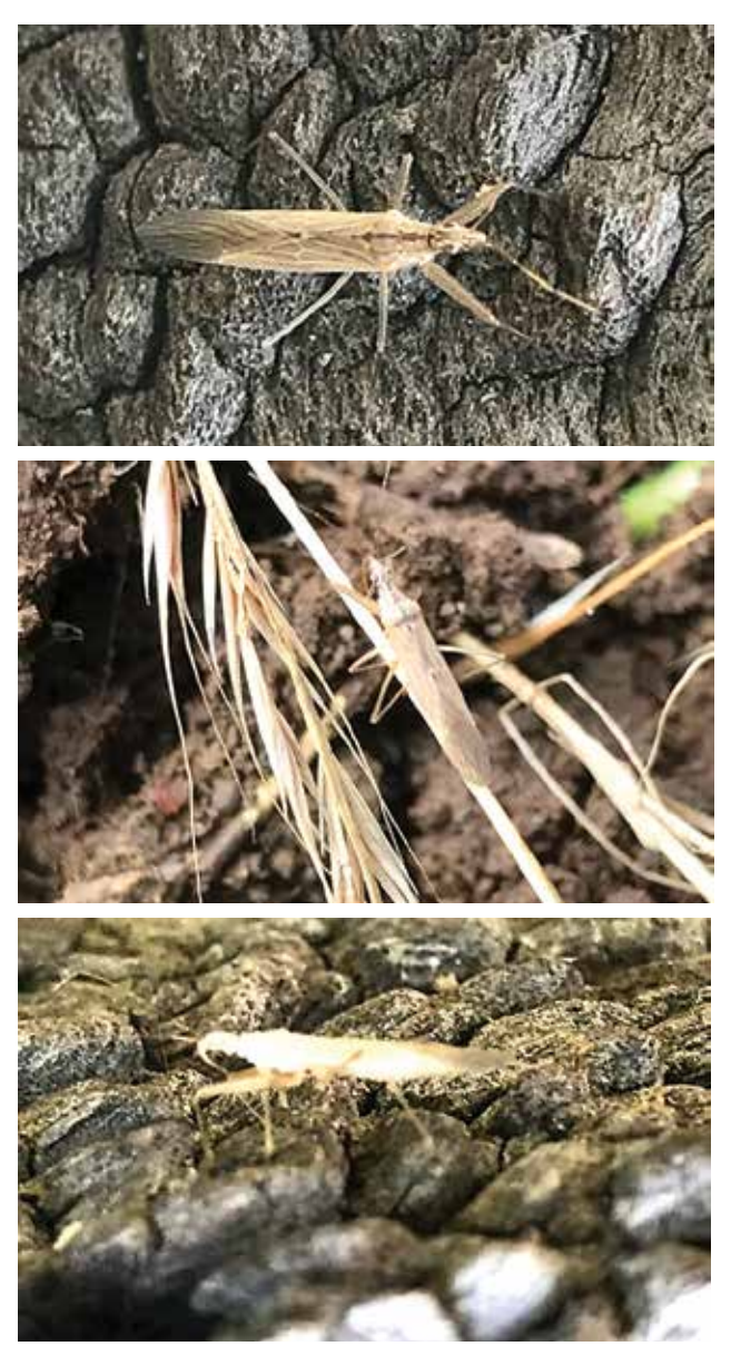
Figure 13 A Pacific damsel bug, Nabis kinbergii (top), and camouflaged against a dry grass plant stem (middle)

Sensitivity to sprays : predatory bugs are particularly sensitive to carbaryl, methomyl, fipronil, indoxacarb, organophosphates, pyrethroids and spinosad (Thomson 2012). Residues on foliage, or in plant tissues, may remain toxic to predatory bugs for many months (Biological Services 2019).