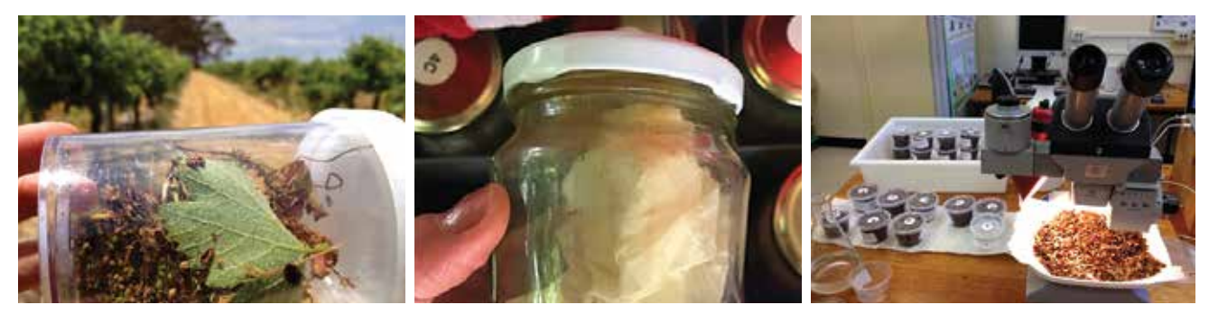
Figure 6 Captured arthropods in a plastic container (left), a euthanising jar (centre), arthropod samples are sorted from plant debris and then identified (right).

Captured arthropods can be viewed non-destructively by looking through the clear plastic storage containers. Alternatively, they can be transferred to a freezer or a euthanising jar, so that they can then be identified under a microscope (see Figure 6).