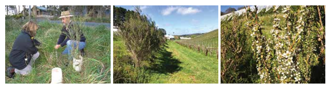
Figure 3 Prickly tea-tree, Leptospermum continentale, during establishment (left), shrubs established as a shelterbelt (centre), and the pollen and nectar producing white flowers (right).