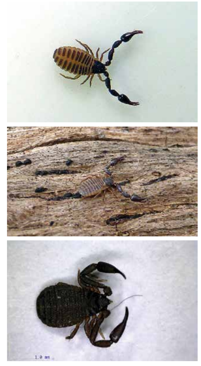
Figure 78 False scorpions (top and middle).

Sensitivity to sprays : collateral damage to false scorpion populations will occur if broad spectrum insecticides are used.