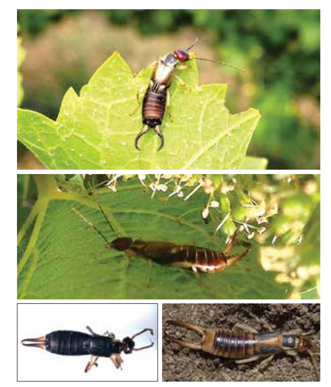
Figure 59 Male European earwigs, Forficula auricularia, on grapevine (top) and (middle).

Significance to viticulture : the European earwig is an important omnivorous predator of light brown apple moth (LBAM) in vineyards (Frank et al. 2007). They may cause