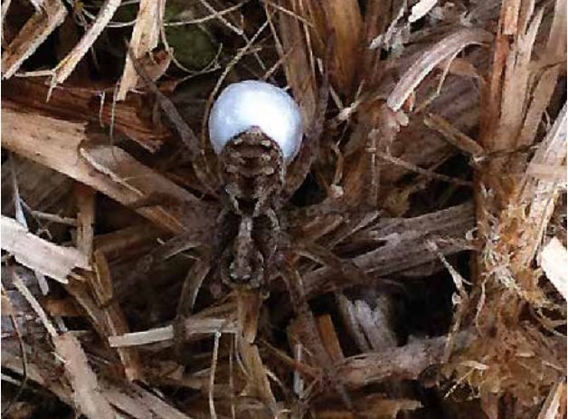
Figure 71 A 'garden wolf spider', Tasmanicosa species, eating a 'lynx spider' (top left); an especially well-camouflaged female 'garden wolf spider', Tasmanicosa godeffroyi, with an egg sac (bottom).