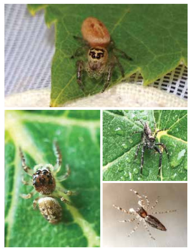
Figure 72 Jumping spiders on grapevine (top and bottom left). Images: Mary J Retallack

Sensitivity to sprays : collateral damage to spider populations will occur if broad spectrum insecticides are used. Spiders are particularly sensitive to mancozeb (Thomson et al. 2007), carbaryl, methomyl, organophosphates and pyrethroids (Thomson 2012).