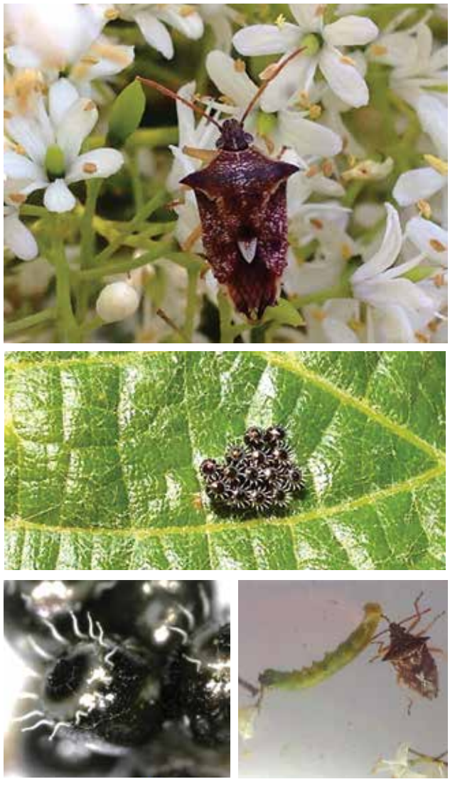
Figure 16 A predatory shield bug, Oechalia schellenbergii, on flowering Christmas bush (top); a raft of eggs on a grapevine leaf (middle).

Sensitivity to sprays: predatory bugs are particularly sensitive to carbaryl, methomyl, fipronil, indoxacarb, organophosphates, pyrethroids and spinosad (Thomson 2012). Residues on foliage, or in plant tissues, may remain toxic to predatory bugs for many months (Biological Services 2019).