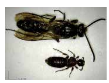
Figure 50 Tiphiid parasitoid wasp – male (top), and female (bottom).