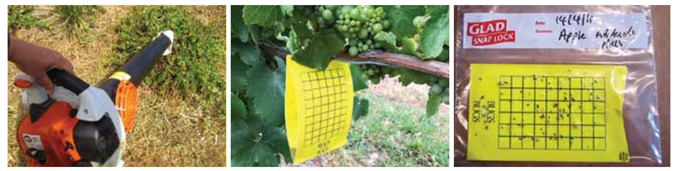
Figure 8 A mechanical vacuum is used to sample arthropods inhabiting a Goodenia plant (left), a yellow sticky trap placed below a grapevine canopy (centre), and the sticky trap stored inside a plastic sleeve to facilitate handling (right).

A mechanical vacuum can be used to sample vegetation by placing a tube into the air intake slot of a leaf blower, and then placing a sock over the opening of the tube. Flying insects such as moths, flies and parasitoid wasps are often sampled using yellow sticky traps placed in the canopy.