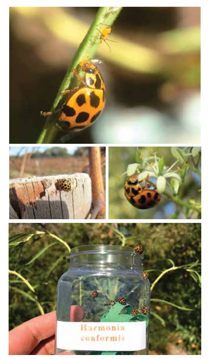
Figure 31 Common spotted ladybird beetle, Harmonia conformis, and shown consuming aphids (top).

Sensitivity to sprays: collateral damage will occur to ladybird beetle populations if broad-spectrum insecticides are used. Ladybird beetles are particularly sensitive to high rates of sulphur (≥400 g/100 litres), carbaryl, methomyl, indoxacarb, organophosphates and pyrethroids (Thomson 2012). Growth regulators such buprofezin are also toxic (Thomson et al. 2007). Residues of some chemicals on foliage may remain toxic for many weeks and negatively impact on ladybird beetle survival (Biological Services 2019).