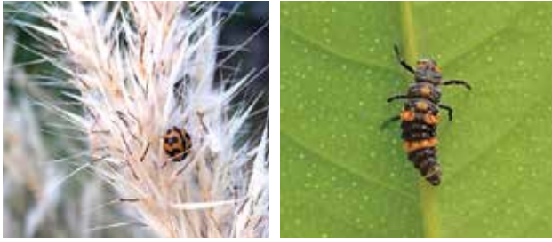
Figure 25 Transverse ladybird beetles, Coccinella transversalis, on grapevine (top and middle).

Figure 26 Transverse ladybird beetle, C. transversalis, on wallaby grass (bottom left); ladybird beetle larva (bottom right)