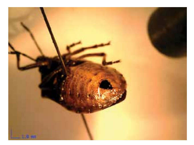
Figure 15 Glossy shield bug, Cermatulus nasalis (top), which can have a black dot on the underside of the abdomen (bottom)

Sensitivity to sprays: predatory bugs are particularly sensitive to carbaryl, methomyl, fipronil, indoxacarb, organophosphates, pyrethroids and spinosad (Thomson 2012). Residues on foliage, or in plant tissues, may remain toxic to predatory bugs for many months (Biological Services 2019).