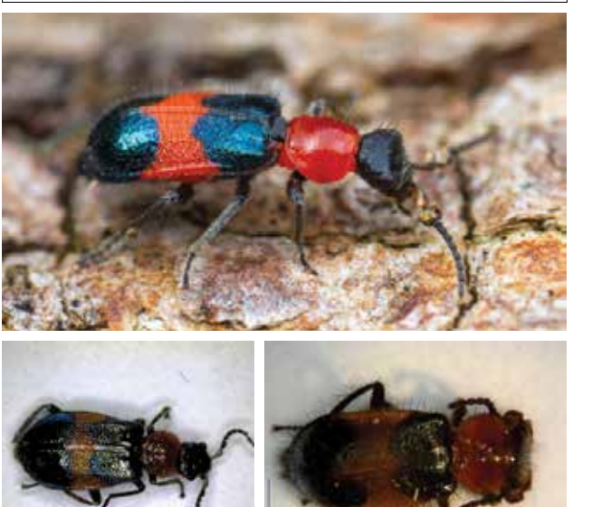
Figure 35 Female red and blue beetle, Dicranolaius bellulus (top).

Figure 36 Female red and blue beetle, Dicranolaius bellulus (middle).