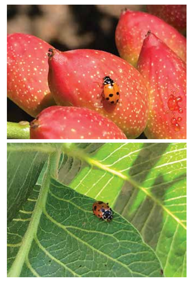
Figure 34 Spotted amber ladybird beetle, Hippodamia variegata, on pistachio (top and bottom).

Sensitivity to sprays : collateral damage will occur to ladybird beetle populations if broad-spectrum insecticides are used. Ladybird beetles