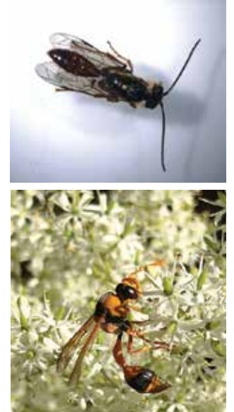
Figure 51 Vespoid predatory wasp (top right); 'orange potter wasp', Eumenes latreilli, a vespoid predatory wasp, on Christmas bush (bottom right).