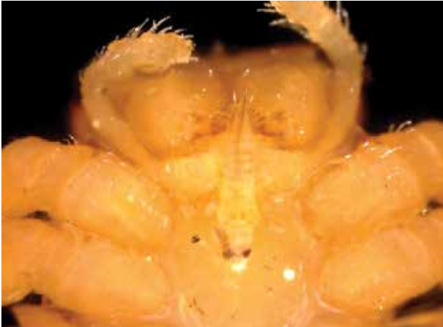
Figure 70 An adult triangular spider (top); a triangular spider eating a 'western flower thrips' (bottom).