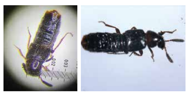
Figure 38 Rove beetles.

Most rove beetles live their lives hidden in leaf litter or under bark. The shortened elytra and freely moveable abdomen are adaptations for foraging efficiently in dense vegetation.