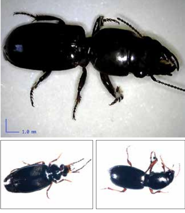
Figure 21 Ground beetle, Geoscaptus species (top).

Breeding cycle : eggs are laid in the soil, leaf litter or rotting wood. The larvae pass through three stages before pupation. Adult ground beetles can live from one to four years.