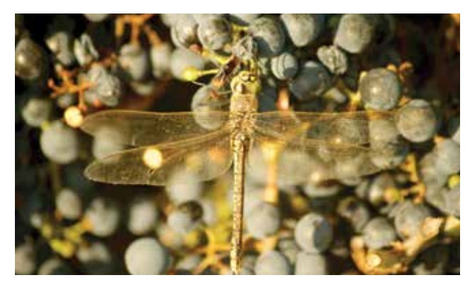
Figure 9 A dragonfly amongst grapes.

Habitat: adults are territorial. They live and hunt near water sources and are also commonly found in vineyards, especially when there is a dam or creek nearby.